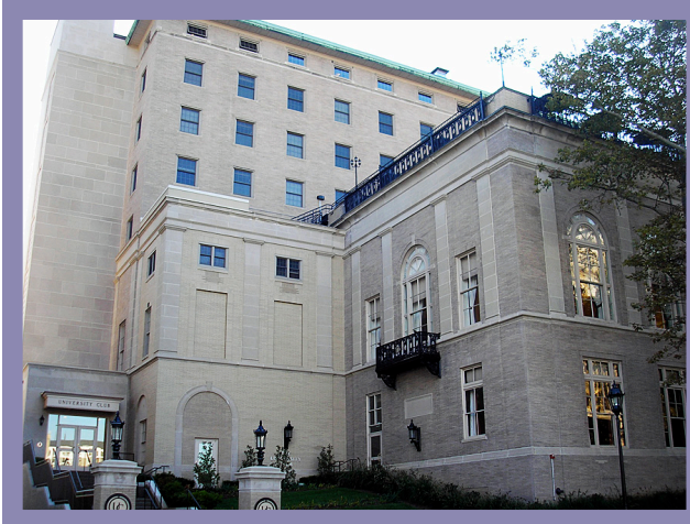
"University Club" by Crazypaco is licensed under CC-BY-SA 3.0